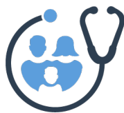
Family Physical Health History

faceless initial market development strategy concentrates upon a globally-based, Direct Interest Group , which is comprised of students, faculty, and staff of schools of medicine, epidemiology, public health and other medical and health science-related disciplines. The Direct Interest Group will appreciate the inherent value of the information that will be produced by faceless and will benefit from that information in their medical and health-related professional endeavors. Upon successful enrollment of the Direct Interest Group, Daedalus will turn to acquisition of members through traditional marketing methods and social media. Complementing those efforts will be acquisition of users from various Direct Incentive Groups that will involve users from around the world that would not, otherwise, be able to participate without incentives.